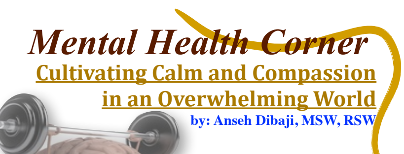
"Although the world is full of suffering, it is full also of the overcoming of it" - Helen Keller

I know that I am not alone in periodically feeling overwhelmed by the bombardment of endless terrible news and sorrow that comes through the various forms of media. There is so much upheaval and suffering in the world; refugee crises, mass shootings and terrorism, the rise of nationalism and Nazism, the continued destruction of our natural environments, human rights abuses and something dubbed "post-Trump election distress syndrome". Our 24-hour news cycle and non-stop exposure to the deluge of suffering in the wider world and in our own community can inevitably lead to exhaustion and burnout.